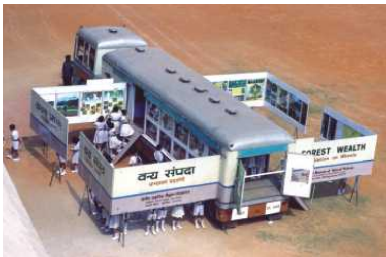
Fig.63 An exhibition on wheels displayed in school campus

A two-days Workshop for High School students in Mysore on "Conservation of Karnataka Heritage" was organised during 29-30 June, 2007 by the Museum in collaboration with the State Departments of Archaeology, Museums and Heritage and the Dept. of Archives, in which 25 teachers participated. As a part of the programme the various heritage structures in Mysore city were shown and explained to teachers.