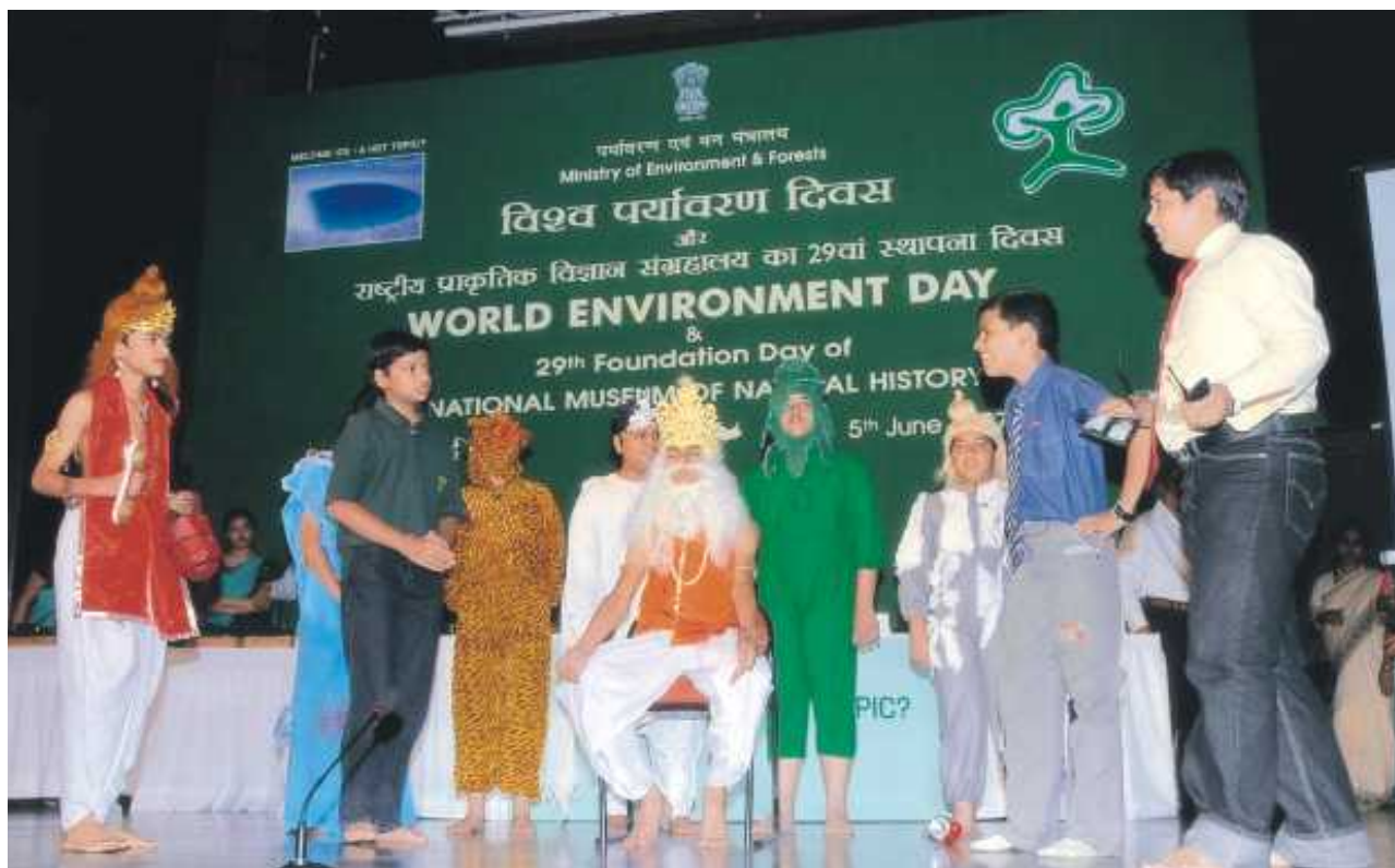
Fig.66 World Environment Day celebrations by NMNH