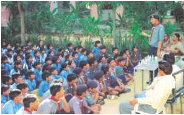
Fig.60 Eco-club guide delivering lecture to its members during a seminar on environmental protection and conservation