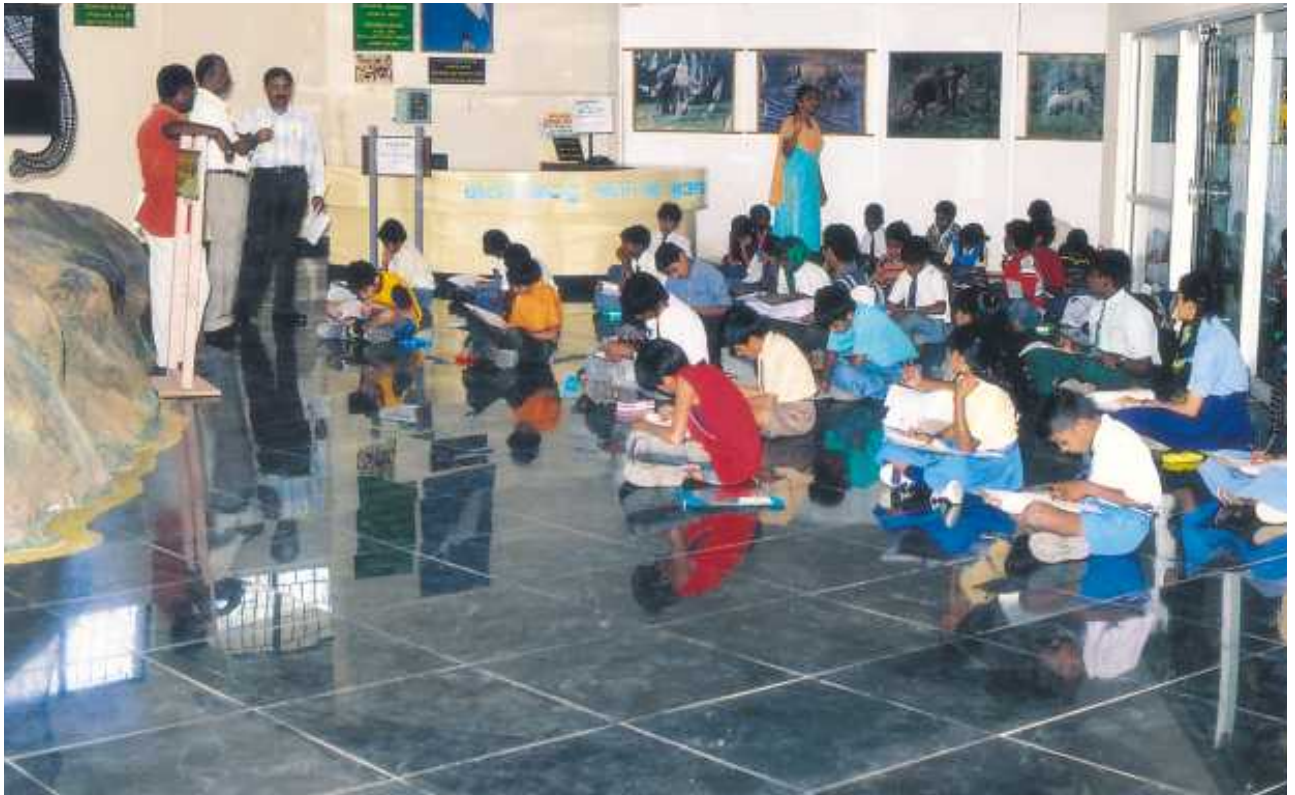
Fig.64 Painting competition organized on National Science Day by NMNH