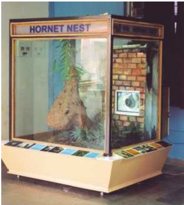
Fig.65 A display of Hornet Wasp nest at RMNH, Mysore

Twenty seven Teachers from 27 districts participated. The programme included lectures on different topics related to eco-club activities. Field visit to RPRC, and Nandankanan Zoo was undertaken to show medicinal plants, vermiculture, vermi-composting & rain water harvesting.