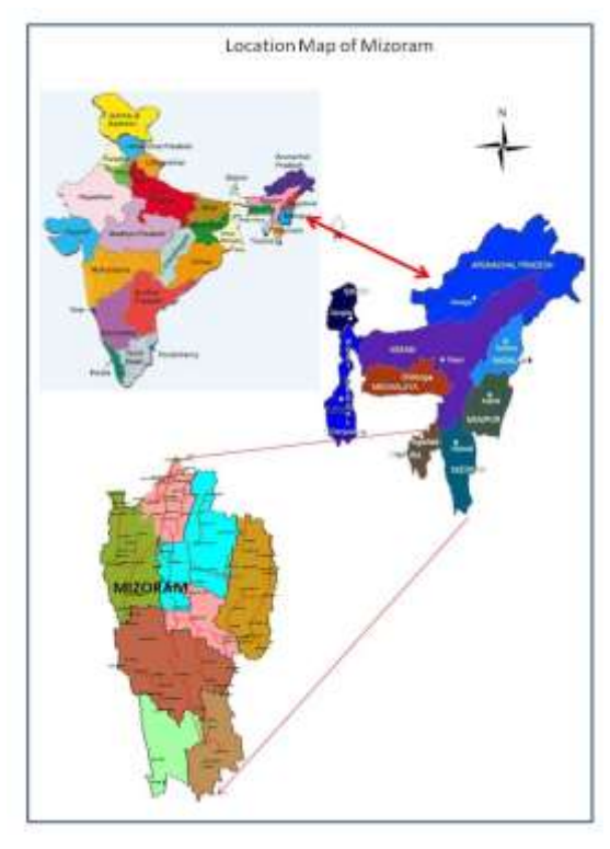
Figure 1: Map of Mizoram

Economy of Mizoram (Map of state is at Fig.1 ) is predominantly agrarian, with more than 60% of the total work force engaged either directly or indirectly in agriculture. However, agriculture still remains under- developed and the primitive method of jhum (shifting cultivation) predominates. Both production and productivity are relatively low. Majority of the land falls under class-IV category of land use capability,