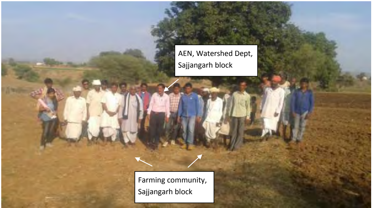
Map prepared through transit walk on 29.10.16 at Goykapargi village block Sajjangarh