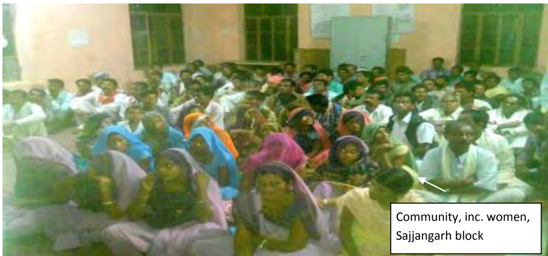
Community, inc. women, Sajjangarh block