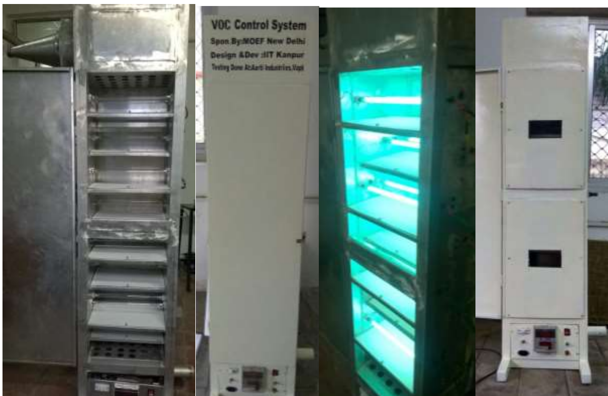
Figure 4: Images of the Scaled-up VOC Control System

The new equipment was tested and it showed an average reduction of about 75% in benzene.