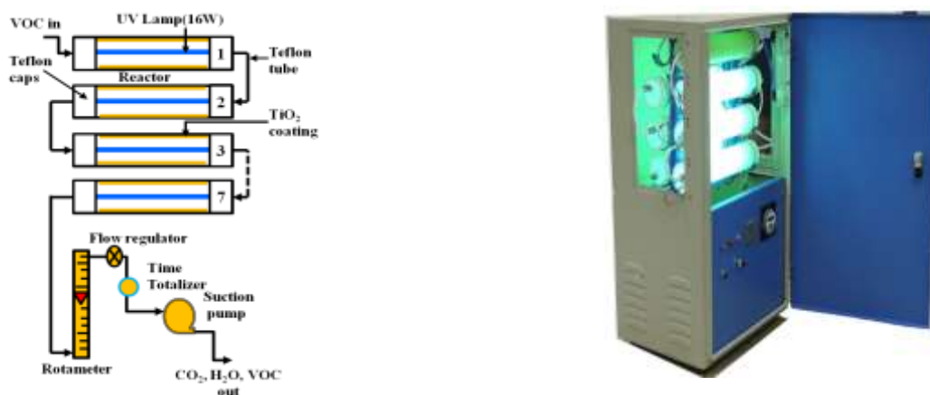
Figure 1: Full-scale VOC control device (schematic)

One reactor for each VOC was operated successively (without regeneration) for 0-1, 1-3, 3-5, 5-7, 7-9, 9-11, 11-13.5 hours, and the degradation rate was examined (Figure 2; as an example of benzene). It is important to note that in each successive experiments, the degradation rate constant for each compound progressively decreased, due to deactivation of catalytic surface with time (Table 2). This is possibly due the formation of highly adsorbed intermediates during the PCO of VOCs that leads to an abrupt decrease in the number of active sites during the reaction on catalyst surface.