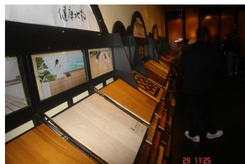
Display area of Bamboo Flooring.

Products were added with value by improving their aesthetic appearance by coating them with attractive colours using screen printing technology.