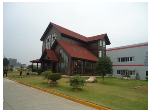
Bamboo Housing Structures.

Bamboo lumber based beams & column structures were produced and many models of housing systems were constructed with in the factory campus but however it was observed that these bamboo based (timber) tiles may not be competitive enough to be used in wet environment such as toilets. It is also expected that the toxic emissions to be more as every part of the structure consisted some or other resin.