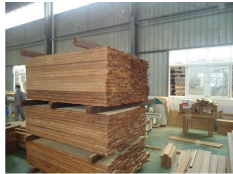
Production of Bamboo Based Lumber.