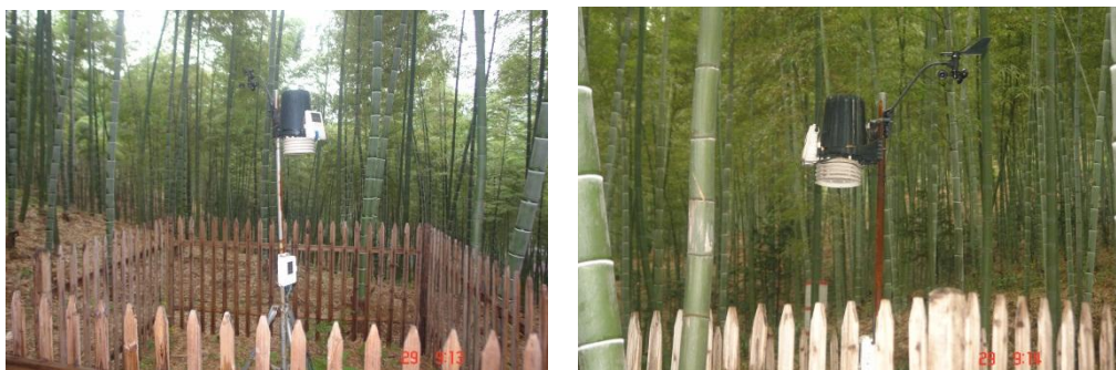
Weather Monitoring/Recording devices installed at Anji Bamboo Botanical Garden

Scientific inputs are tracked and implemented to manage the monopodial bamboo crop mainly Phyllostachys pubescence (MOSO bamboo). Availability of necessary infrastructure for transporting bamboo from diesel points to factory gates is ensured to attract more farmers to cultivate bamboo in their lands. Apart from this farmers are also assured of linkages for marketing the raw materials to factories. Weather monitoring equipment is installed to collect the climate data which forms base line data for climate change studies.