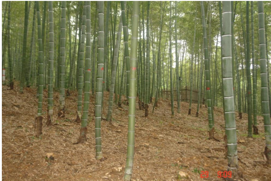
Plantation of Moso bamboo at Anji Bamboo Botanical Garden

It was observed that the bamboo cultivation is promoted by providing subsidies to farmers to seek their direct involvement and attracting them by various government policies which raises the interest of the farmers to cultivate bamboo in their land.