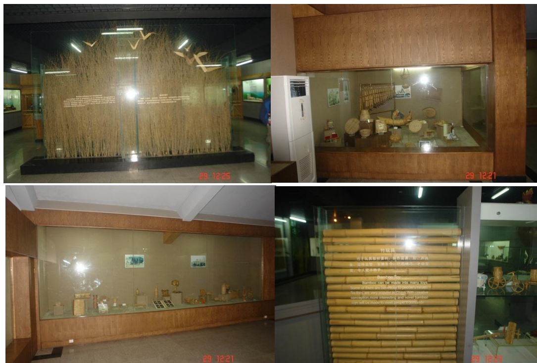
Display area at Bamboo Museum.

A one stop display of information about bamboo, its cultivation & utilization was portrayed under one roof which explained the various species of bamboo its properties advantages & disadvantages faced during cultivation and the end utilization of different species of bamboo.