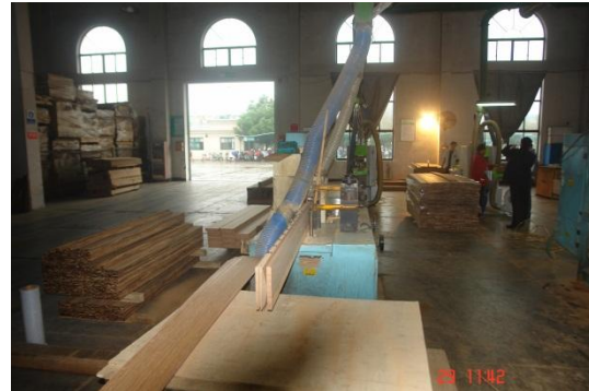
Production of Bamboo lumber at Zhejiang Yongyu Bamboo Joint – Stock Co. Ltd.